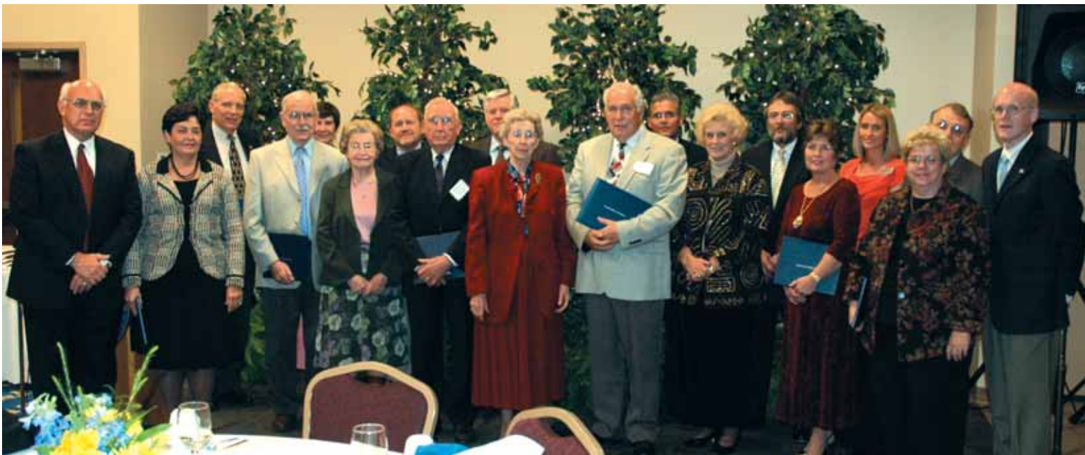
Citation Club donors at the 2006 banquet.